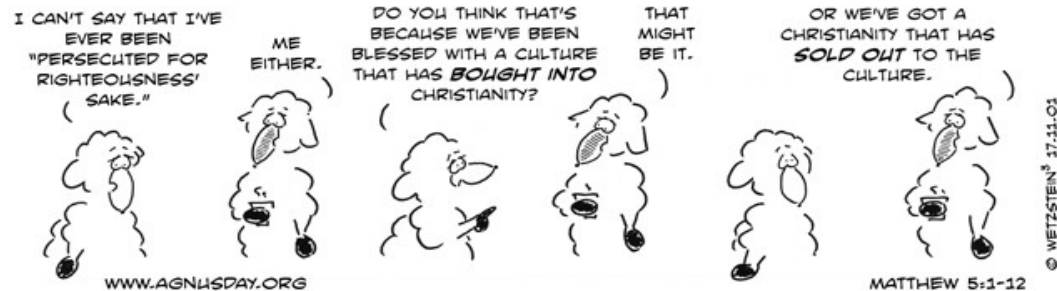
Weekly Evangelist (4)