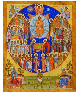
Weekly Evangelist (1)