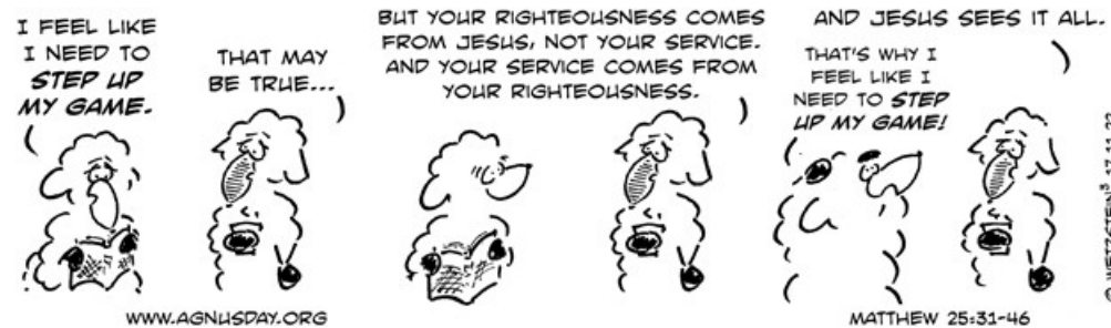
Weekly Evangelist (4)