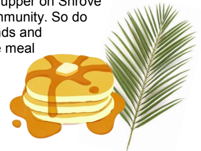
Weekly Evangelist (1)