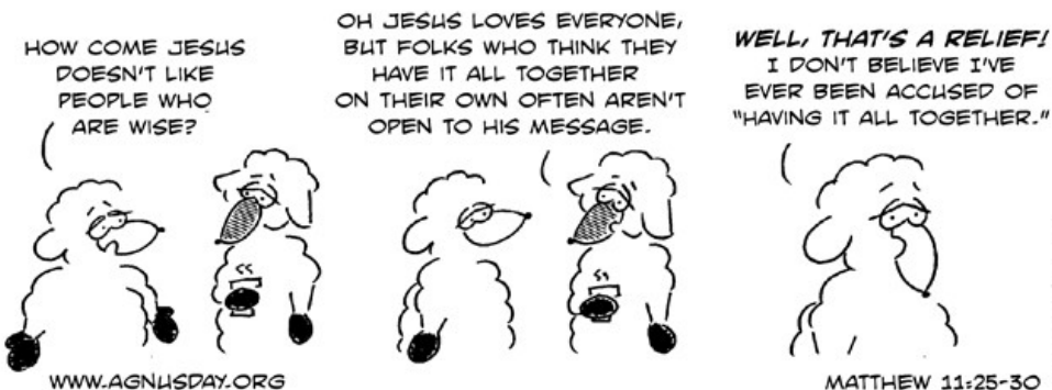
Weekly Evangelist (4)