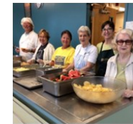
Some of the crew serving at the Salvation Army, July 7th